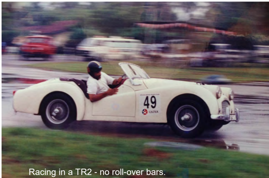
Racing in a TR2 - no roll-over bars.

Here are some images from monthly classic car runs and race meetings in Colombo, Sri Lanka. Kindly provided by Odath Werasinghe (Vic).