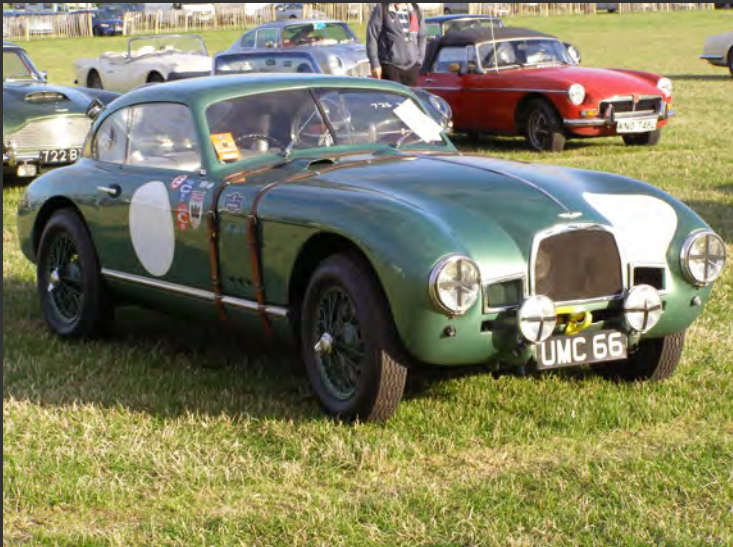
PHOTO ESSAY - GOODWOOD REVIVAL