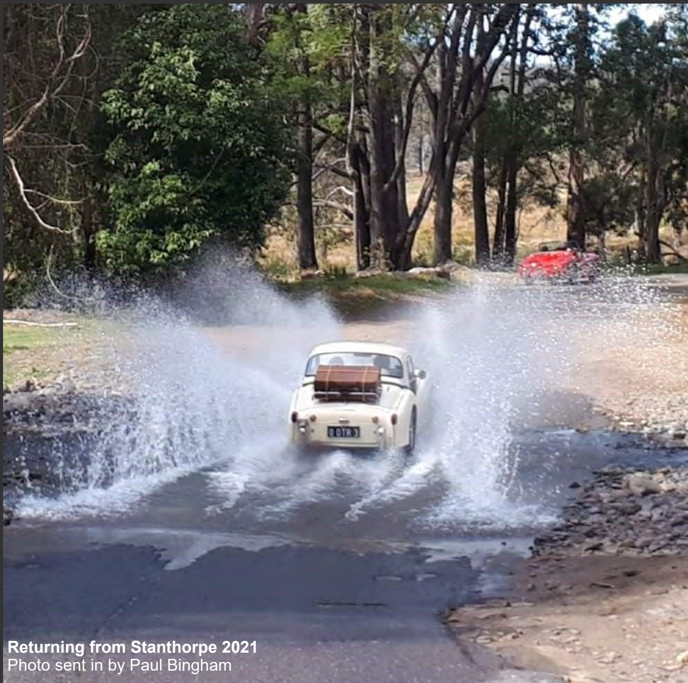
Returning from Stanthorpe 2021