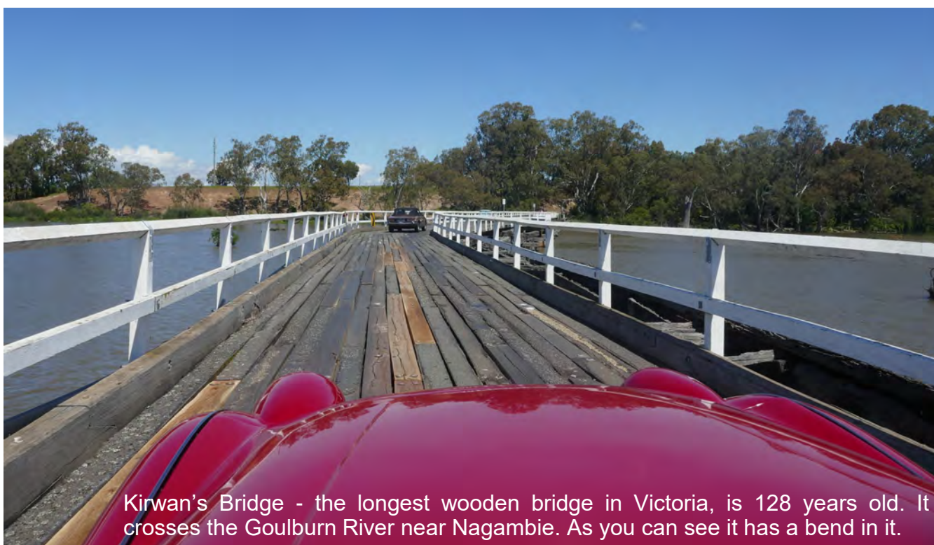
Kirwan's Bridge - the longest wooden bridge in Victoria, is 128 years old. It crosses the Goulburn River near Nagambie. As you can see it has a bend in it.