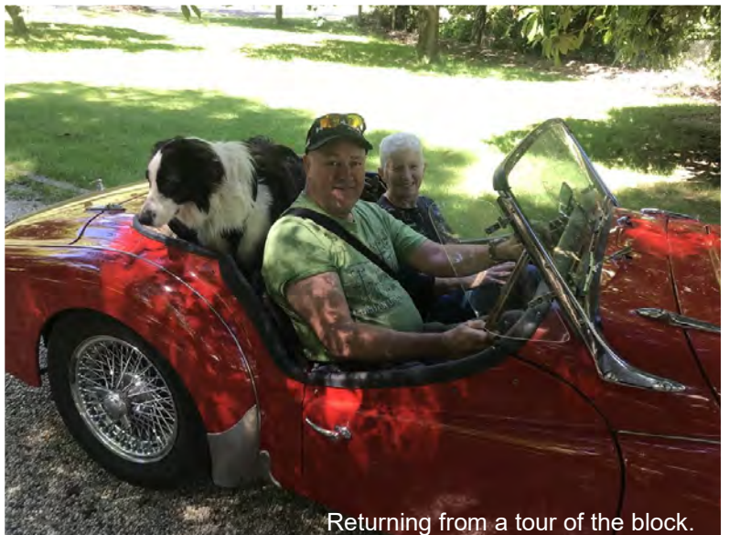
Returning from a tour of the block.