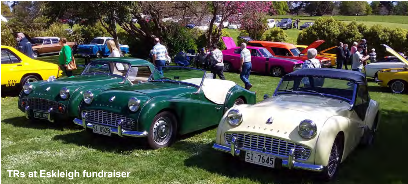
TRs at Eskleith fundraiser