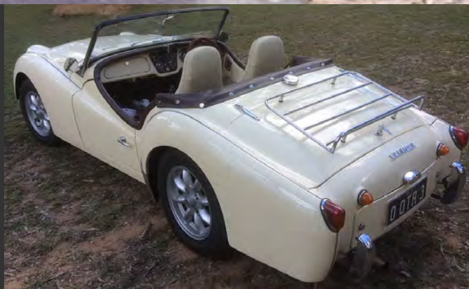
The TR: Peter and Sue Clarke's TR3A 1960 model TS 80257.